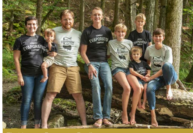
The Vermont Evaporator Family

The first year we made 100 evaporators. Now, that number continues to creep up along with other items including filter kits, bottles, finishing temperatures gauges and more. In the